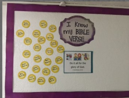
Memorizing Bible Verses