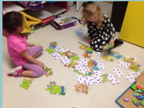
Puzzles in Center Time