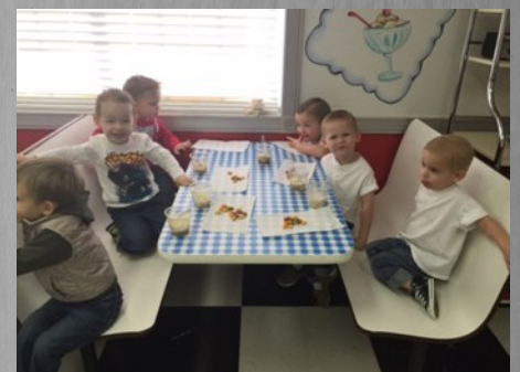
Root Beer Floats

As you can see, there is never a dull moment at Weekday School!