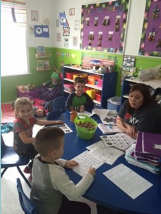
Small group Learning

Some of the ways we spend our time at Weekday School are: