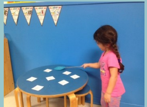
Individual Hands on Learning