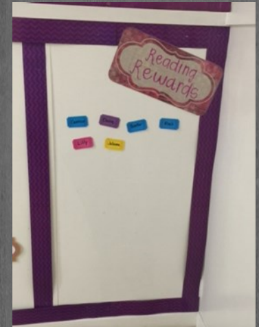
Reading at Home

We recently celebrated our 50 th day of school with 1950s inspired activities!