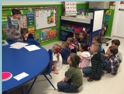
Classroom Circle Time