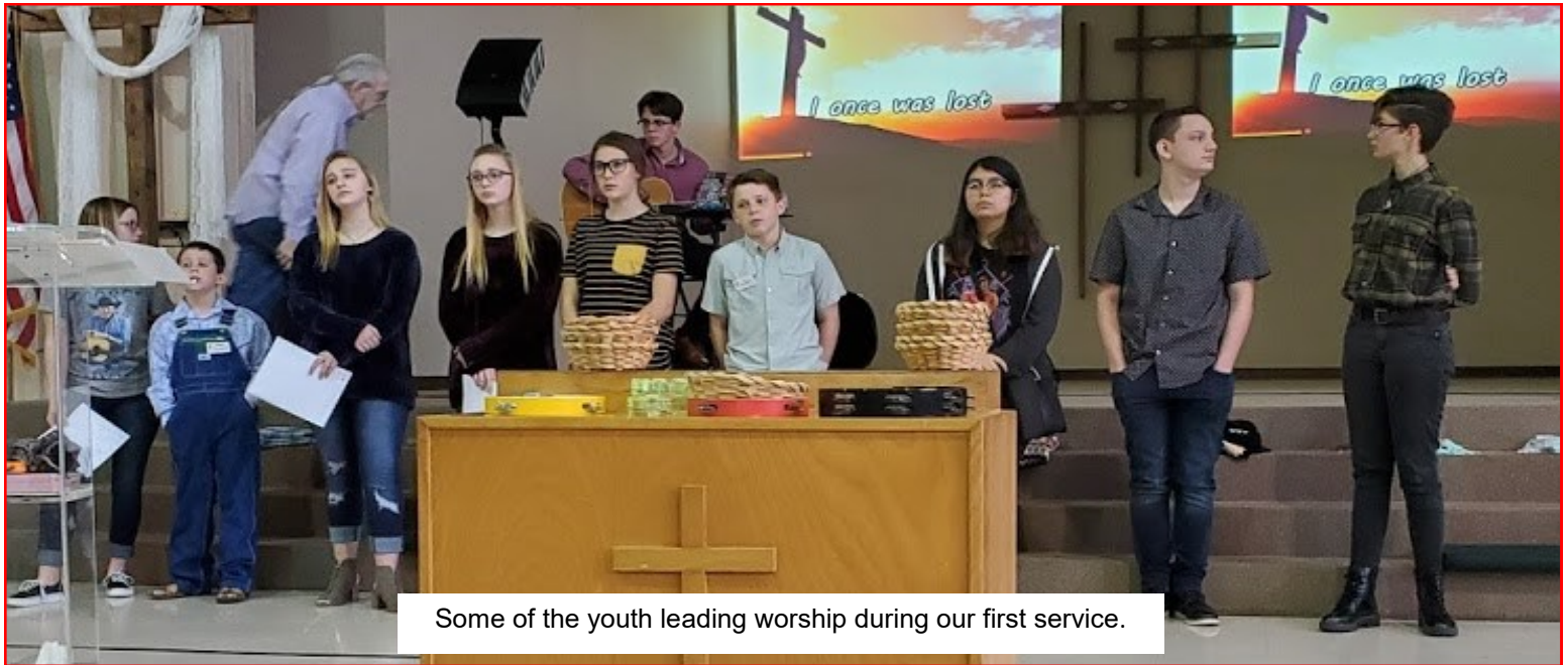
Some of the youth leading worship during our first service.

W.A.R.R.I.O.R.S. Youth Group is open to all kids 6th grade—12th